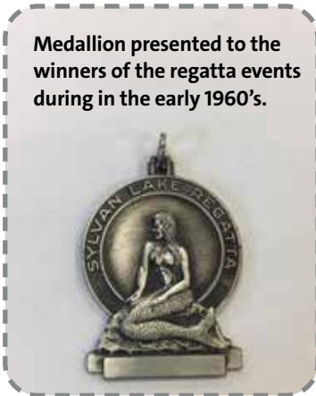
Medallion presented to the winners of the regatta events during in the early 1960's.