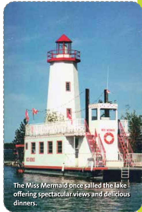
The Miss Mermaid once sailed the lake offering spectacular views and delicious dinners.

continues her presence in a variety of ways. At one time you could have dinner and cruise around the lake on the Miss Mermaid. The symbolism of our community spirit is also commemorated at the annual Sylvan Lake Chamber of Commerce Miss Mermaid Ball, which celebrates and awards its shining business stars. So, as you pass the fountain be reminded of all the hard work of the many volunteers who made it, and continue to make Sylvan Lake a great place.